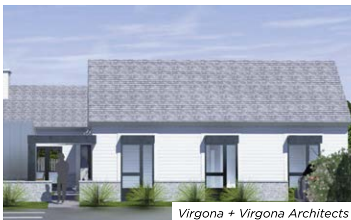
Virgona + Virgona Architects