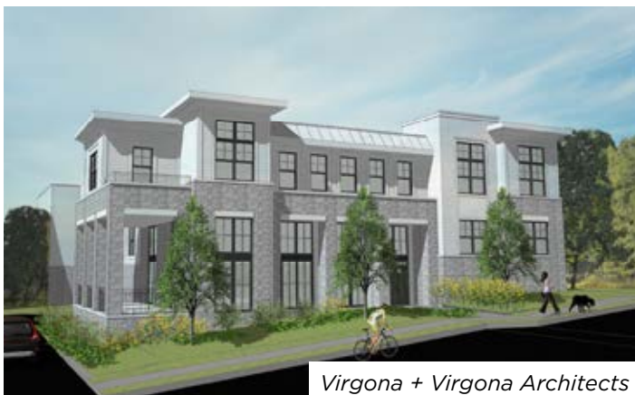
Virgona + Virgona Architects