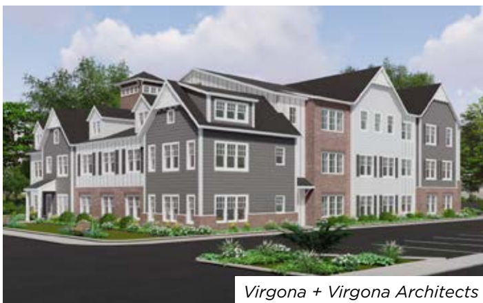
Virgona + Virgona Architects